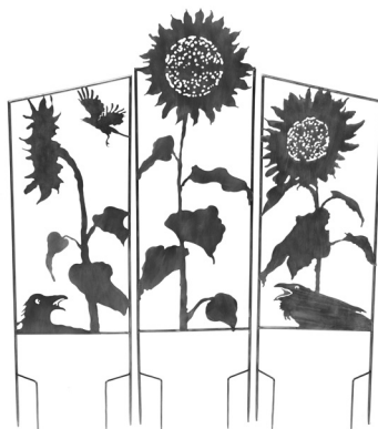
Sunflower Garden Screen Set

For more garden decorations and ideas, please visit us at gardeners.com .